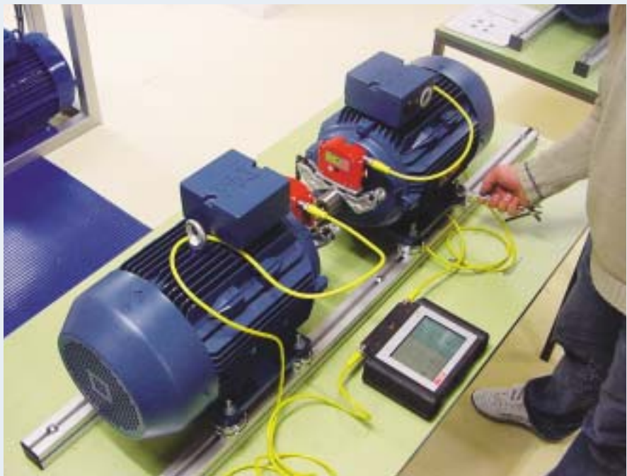
Machine Support’s alignment training programmes include hands-on exercises.

The capability of self-levelling combined with the height adjustment feature prevents the possibility of equipment “soft foot” in the production