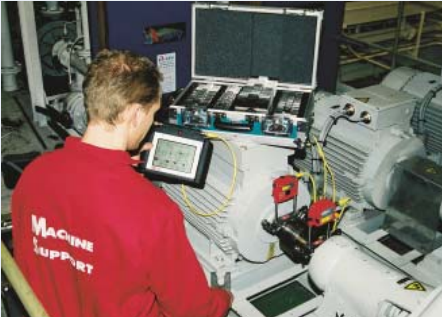
Fast and accurate shaft alignment, using Fixturlaser® shaft 200 and Steelshim® shim kits.

M achinery mounting, alignment services and mounting solutions have become a group focus following the acquisition in 2000 of Dutch specialist Machine Support BV.