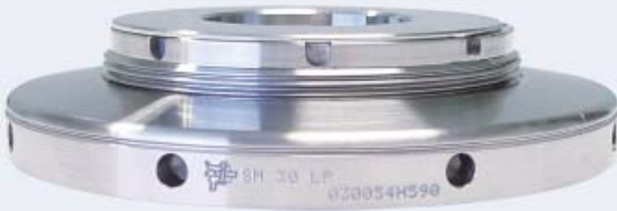
Vibracon® SM Low Profile for chocking arrangements with limited height, starting from 20 mm.

line and for the life cycle of the machinery. The height adjustment feature makes Vibracon® SM easy to install.