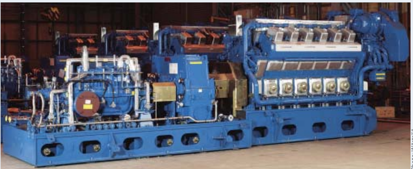
Wärtsilä-Sulzer-Lufkin pumping unit mounted on Vibracon® SM elements, providing easy re-alignment anywhere in the world.